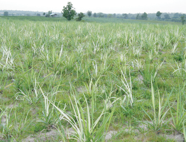
Fig. 3. A field of sugarcane in northeast Thailand heavily affected with white leaf disease.

cannot be cultured, and so far there is no resistant sugarcane variety or effective method to control SCWL disease, except elimination of infected plants to decrease the amount of phytoplasma inoculums. Approaches such as tissue culture technique or hot water treatment have been applied to ensure disease-free cane stalks, but these strategies have not been able to effectively control or prevent the disease.