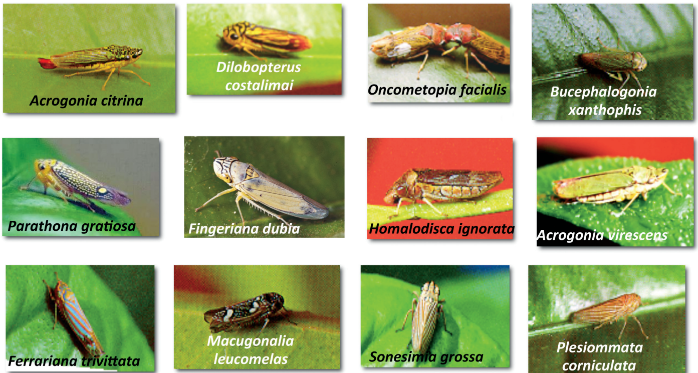
Fig 7. Brazilian leafhopper vectors of Citrus Variegated Chlorosis.

endophytic bacteria may transform the endophytes into symbiotic control agents for CVC.