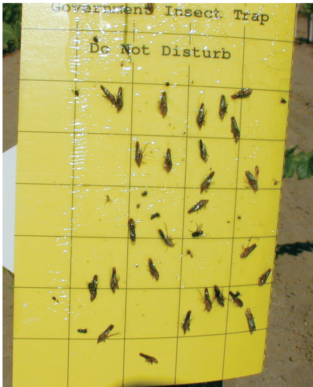
Fig. 5. One week of glassy-winged sharpshooters, Homalodisca vitripennis , on yellow sticky cards in research vineyard at UC Riverside, 7 July 2009. The lines are one inch apart (2.54 cm).

threat to the wine industry in Southern to Central California (Castle et al. 2005). Indeed, since the first identification of GWSS in the California vineyards, programs aimed at controlling the dissemination of this insect as a strategy to prevent PD outbreaks have involved more than $160 million of direct investments ( http://www.cdffa.ca.gov/phpps/pdcp/ ). So far, GWSS has not become established in Northern California because of an aggressive quarantine program.