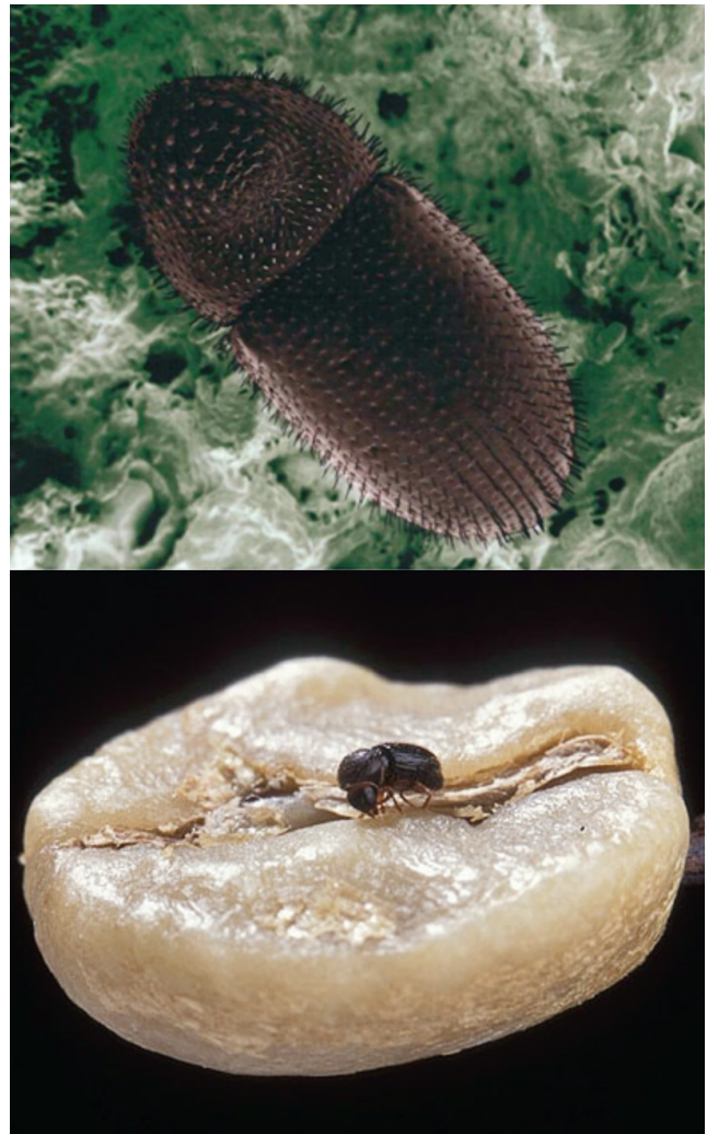
Fig. 1. Coffee berry borer, Hypothenemus hampei Ferrari.

The insect poses a formidable control challenge due to its cryptic nature inside the coffee berry (Fig. 2). Infestation begins when a female bores a hole in the coffee berry and deposits up to 300 eggs (Jaramillo 2008) in galleries within the seed. Once the larvae hatch, they start consuming the seed, reducing both quality and yield. Two factors make the insect even more problematic: the sex ratio of the species is skewed, favoring females 10:1 (likely due to the presence of the maternally inherited intracellular alphaproteobacterium Wolbachia or another male-killing agent [Vega et al. 2002b]); and