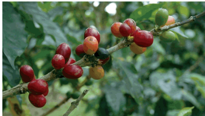
Fig. 2. Coffee berries ready for picking.

sibling mating inside the berry means that females are inseminated and ready to oviposit as soon as they exit the berry.