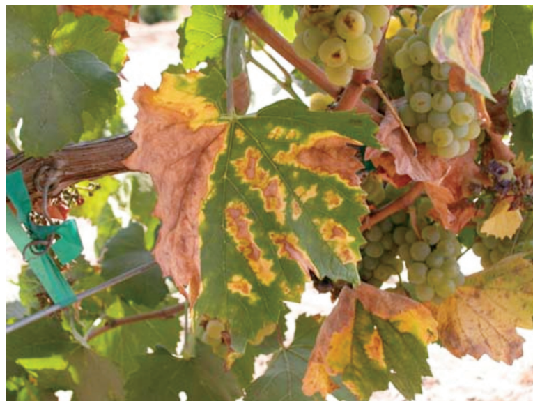
Fig. 4. Pierce’s disease symptoms in Chardonnay grapevines, Temecula, California, 2004. Leaf scorch characteristic is clearly evident and the grapes themselves slightly shriveled.

Pierce’s disease (PD) of grapevines (Fig. 4) was first detected in Southern California in 1884, where it destroyed approximately 40,000 acres of grapes in Anaheim, CA, during a five-year outbreak (Pierce 1892, Goodwin and Purcell 1992). Following this devastating experience, which was restricted to Orange County, PD became only an occasional concern to West Coast viticulture for many decades because of the preference of native vector leafhoppers for riparian habitats. This all changed when the glassy-winged sharpshooter (GWSS), Homalodisca vitripennis Germar (Hemiptera: Cicadellidae; Takiya et al. 2006) invaded California at some point during the 1980s. By the late 1990s, it had caused new epidemics centered in Temecula, where about one-third of the vineyards were lost. The GWSS (Fig. 5) is the most widespread sharpshooter insect vector of X. fastidiosa in the United States. The insect is a major concern for horticultural industries beyond viticulture due to its ability to transmit X. fastidiosa strains that cause scorch diseases in a number of host plants, including X. fastidiosa subsp. fastidiosa , which causes PD in grapevines (Purcell, 2005).